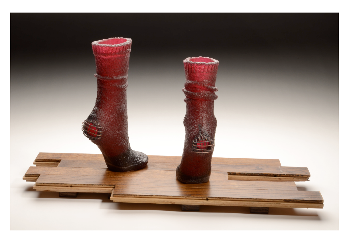
Jennifer Halvorson, Holding Stitch , 2015 Cast glass, copper, found objects, 13.5 \times 26.5 \times 12 inches