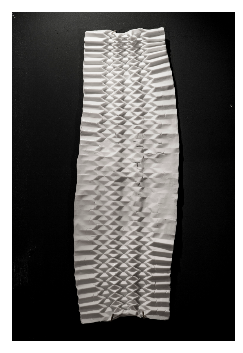
Nisha Bansil, DIAMOND FOLD 2 , 2016 Cast and coldworked glass 31.5 x 11 x 1 inches

Bullseye Projects explores contemporary glass with makers and viewers of all ages. Bullseye Projects is part of Bullseye Glass Company, supporting makers to expand their creativity through glass. To view artwork online, please visit <u>www.bullseyeprojects.com</u>. To receive additional information, request high-resolution images, or schedule an interview, please contact Michael Endo: <u>michaelendo@bullseyeglass.com</u>, 503-227-0222.