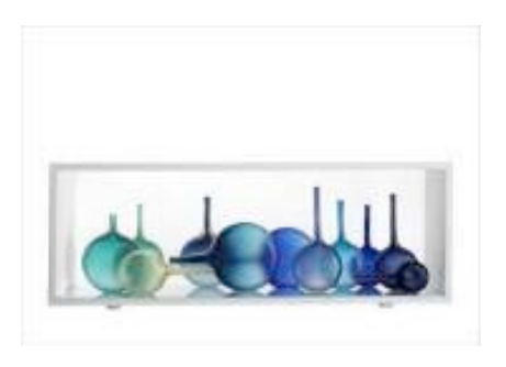
Akiko lwase A Molecule of the Horizon (Japan)