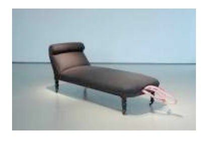
Gitta Gschwendtner Furniture Life (Germany)