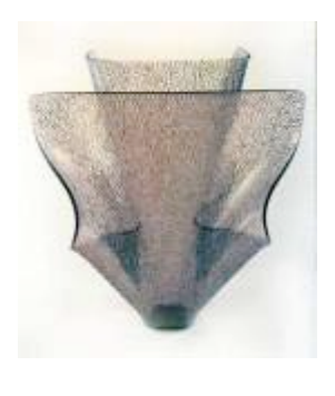
Rozlyn de Bussey, Lappet Form No. 6 (Australia)