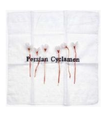
Dafna Kaffeman Persian Cyclamen (Israel)