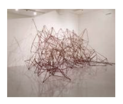
Jack Wax Surviving on the Quality of Listening (USA)