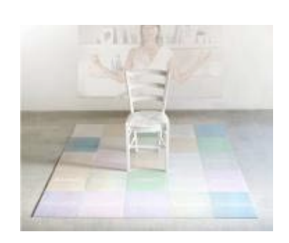
Silvia Levenson Life's Strategies (Italy)