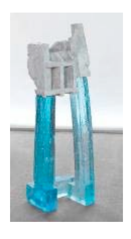
Wilken Skurk Quingelwingelqui from the Series: Living, Living, Dying (Germany)