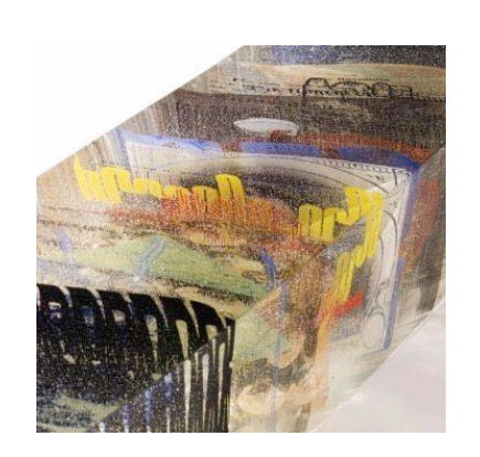
Jeffrey Sarmiento Encyclopaedia (USA)