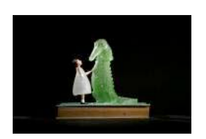
Carmen Lozar Crocodile Tears (USA)