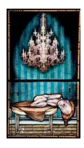
Judith Schaechter Agnus Dei (USA)