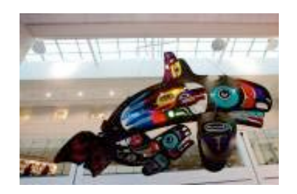
Marvin Oliver Mystical Journey (USA)